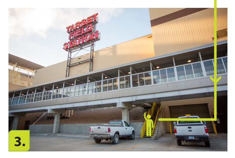
Your tour guide will be waiting for you on the yellow stairs. Enjoy your tour!