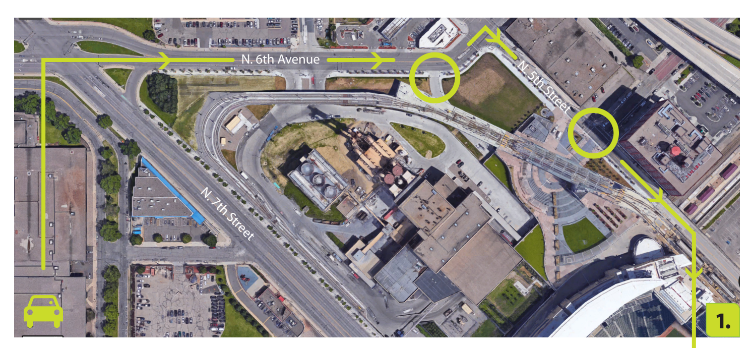
Access the parking ramp from N. 5th St. or 6th Ave. N.

Note that the ramp and street meter parking may be full and/or charge higher rates on Twins game days. Visitors may not park inside the fenced-in confines of the HERC Facility itself unless a charter bus is transporting your group. If you are arriving by bus please let the tour scheduler know in advance.