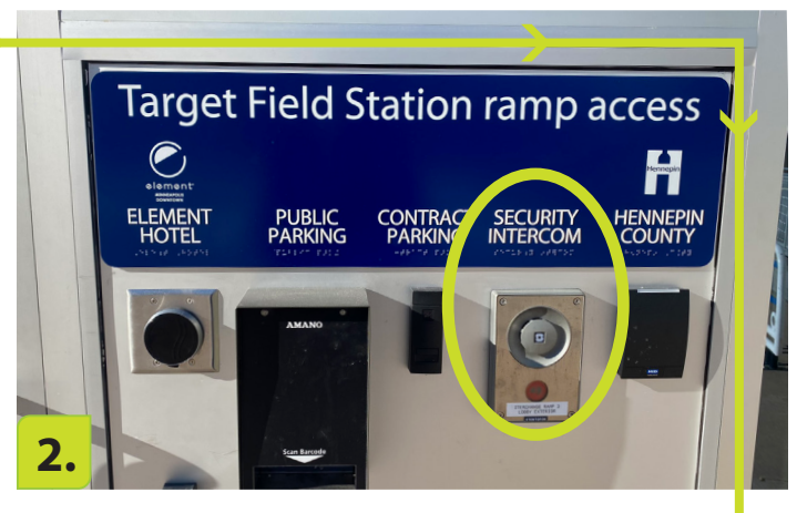
Press the SECURITY INTERCOM button and tell security staff that you have arrived for a HERC tour.