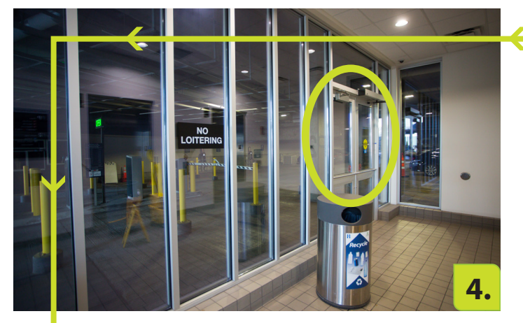
Exit the elevator and walk through the doors to the far right.