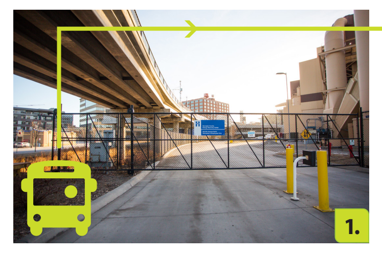
Pull up to the gate and tell the gate operator that you are a tour group.

The HERC Facility charter bus entrance is located at 505 6th Avenue North, Minneapolis, MN 55405 . Turn left after passing under light rail overpass