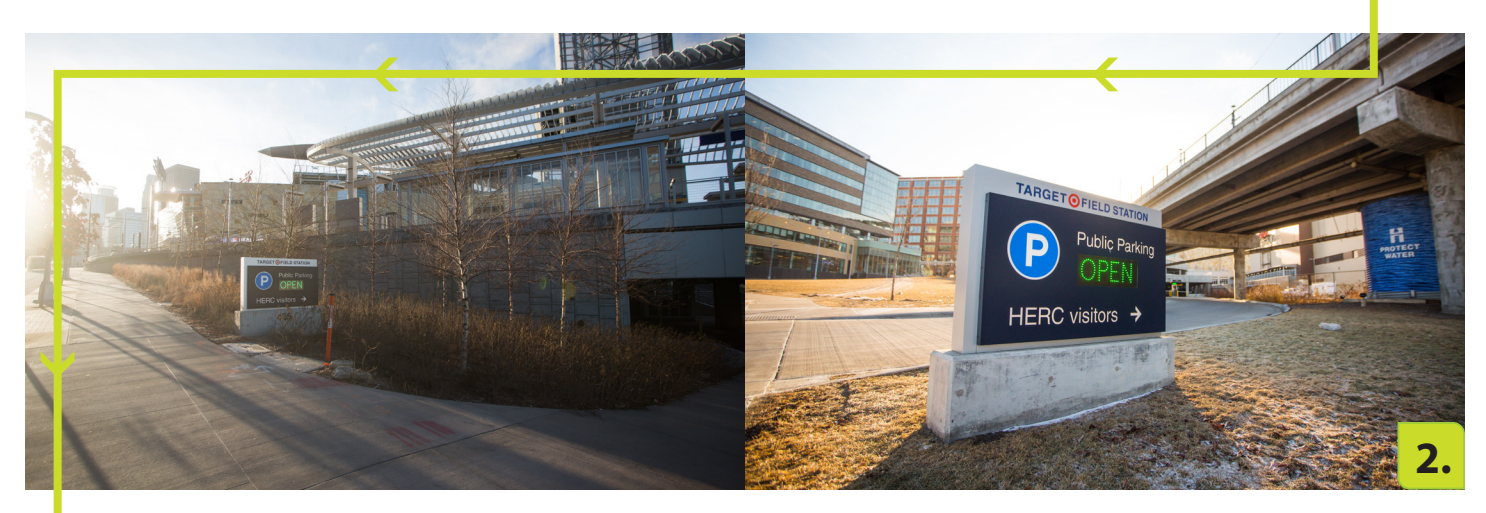
Look for a Target Field Station "HERC visitors" sign. Enter the ramp.