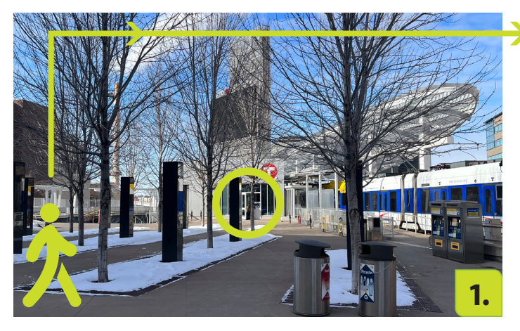
Walk to the access panel next to the glass door under the large screen.

Bicycle racks are available on N. 5th St. on the upper and lower Target Field Station plaza. A Nice Ride station is on N. 5th St. If you are walking: make your way to Target Field Station.