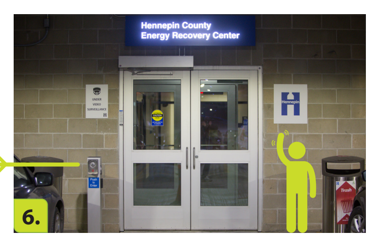
Walk up to the doors and your tour guide will let you in. Enjoy your tour!