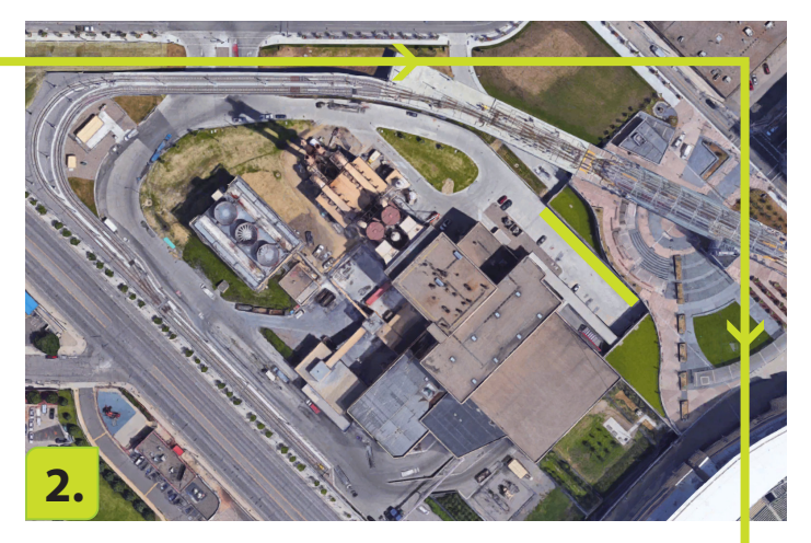
Park on far left side of parking area across from yellow staircase.