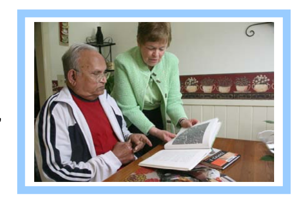
Outreach volunteer services

Patrons continue to use Hennepin County Library services in buildings, online and in the community, at significantly higher rates when compared to our peer libraries that serve populations over one million. Seven out of 10 Hennepin County residents are active library card holders, while our peer group averages 5 out of 10 residents.