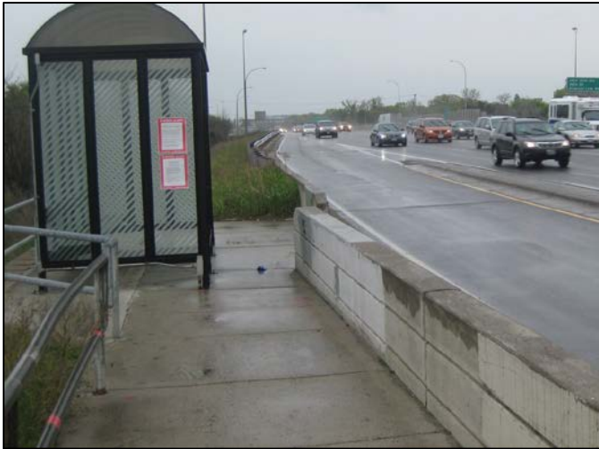
Current Conditions at I-35W and Lake St. on bridge at transit stop