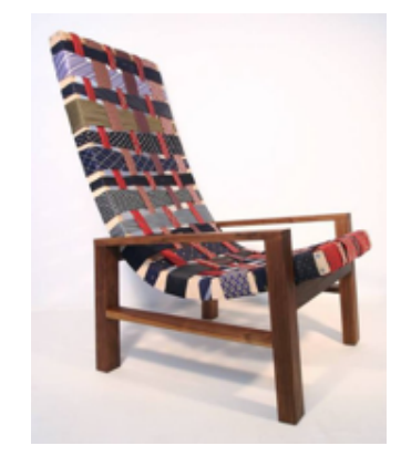
CHAIR REPRESENTING INTERWOVEN COMMUNITY