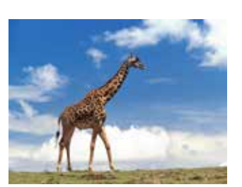
GIRAFFE REPRESENTING STRENGTH OF TODAY WITH THE VISION OF NEW HORIZONS