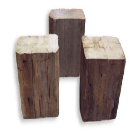
STOOLS REPRESENTING STURDINESS, COMMUNITY