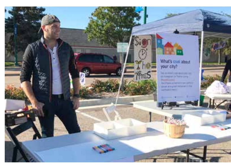
CITY ENGAGEMENT EVENTS