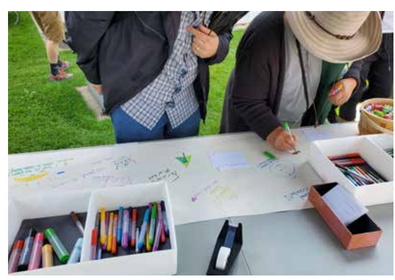
CITY ENGAGEMENT EVENTS