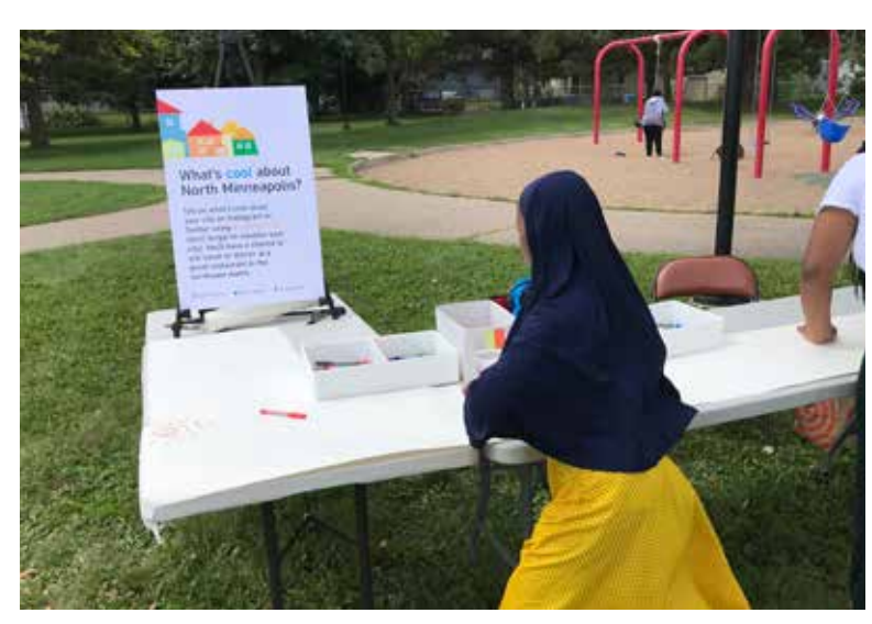
CITY ENGAGEMENT EVENTS