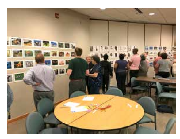
WORKSHOP IN PROGRESS