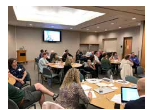
WORKSHOP IN PROGRESS