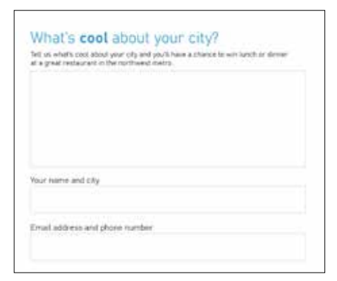
ENGAGEMENT ENTRY FORM