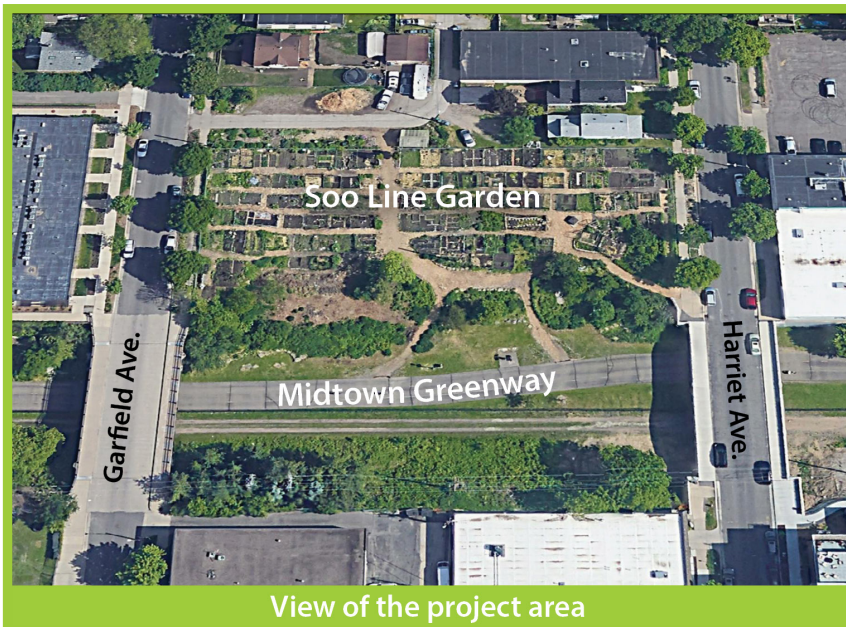
View of the project area

This new ADA access will support Hennepin County's broader climate action and racial equity goals and provide more direct connections from the Midtown Greenway to nearby schools, businesses, housing, parks and bike network in the Whittier Neighborhood and surrounding areas.