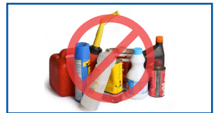
Containers that held hazardous products

Find disposal options for these items and many more on the Green Disposal Guide at hennepin.us/green-disposal-guide