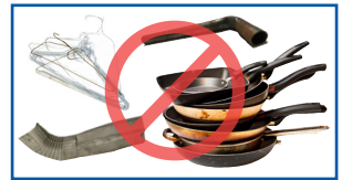
Random metal items