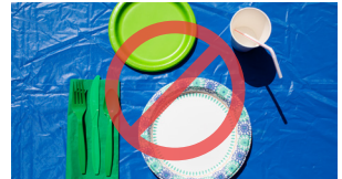
Paper plates, cups, napkins, straws, and utensils