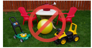
Large plastic items and toys