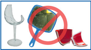
Glass dishes, window glass, and ceramics