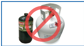
Pressurized cylinders (propane, helium, CO2)