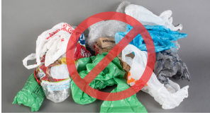
Plastic bags and film

The following items cause problems in the recycling process because they get tangled in equipment, can harm workers, and have no good end markets to make them into new materials. Keep them out of your recycling. Learn more at hennepin.us/recycling