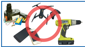
Electronics and batteries