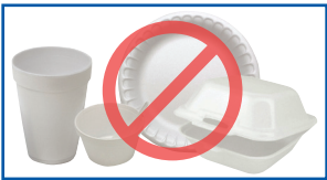
Plastic foam (Styrofoam™)