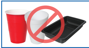
#6 and black plastics