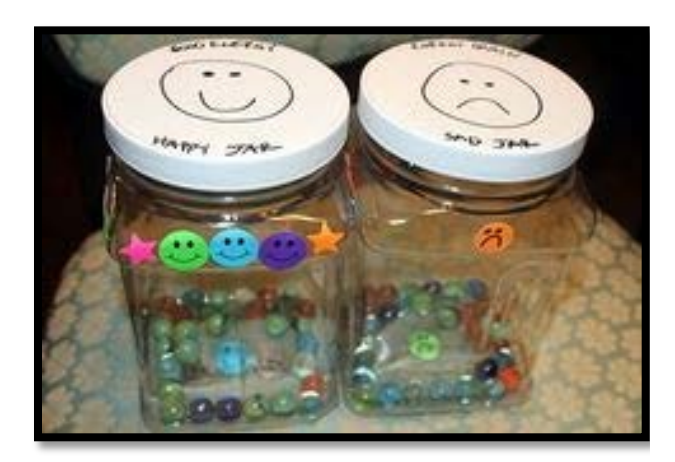
Give each person one marble for each question.

Try something new! Here are some ideas that might help you design a more visual and interactive survey or outcomes tracking process.