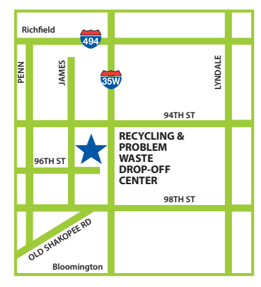
Bloomington 1400 West 96th Street Bloomington, 55431