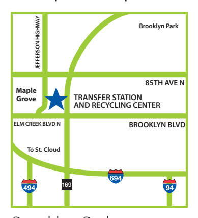
Brooklyn Park 8100 Jefferson Highway Brooklyn Park, 55445