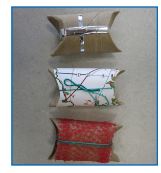
Completed decorated gift card holders.