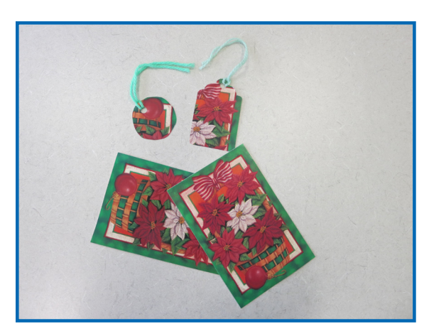
Examples of gift tags made from repurposed greeting cards.

Collect greeting cards. Using scissors, cut the greeting cards into various shapes and sizes as desired. Use a hole-punch to make a hole to tie a ribbon through and attach to gift.