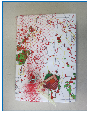
Example of green gift box made from a box.