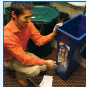
Hennepin County staff help you plan for and set up your recycling program.