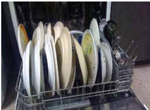
Make reusable dishes and utensils available in your break room to reduce waste.

Find more information and tips for reducing waste at www.rethinkrecycling.com/businesses/how-guides .