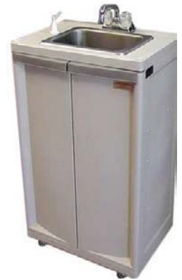
A. Pressurized Hand Washing Sink (Required for events >10 days/year)