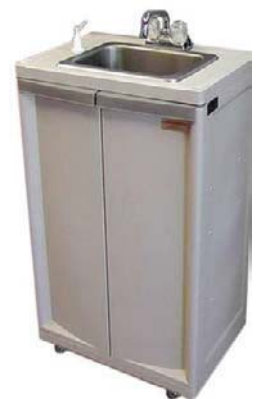
A. Pressurized Hand Washing Sink (Required for events >10 days/year)