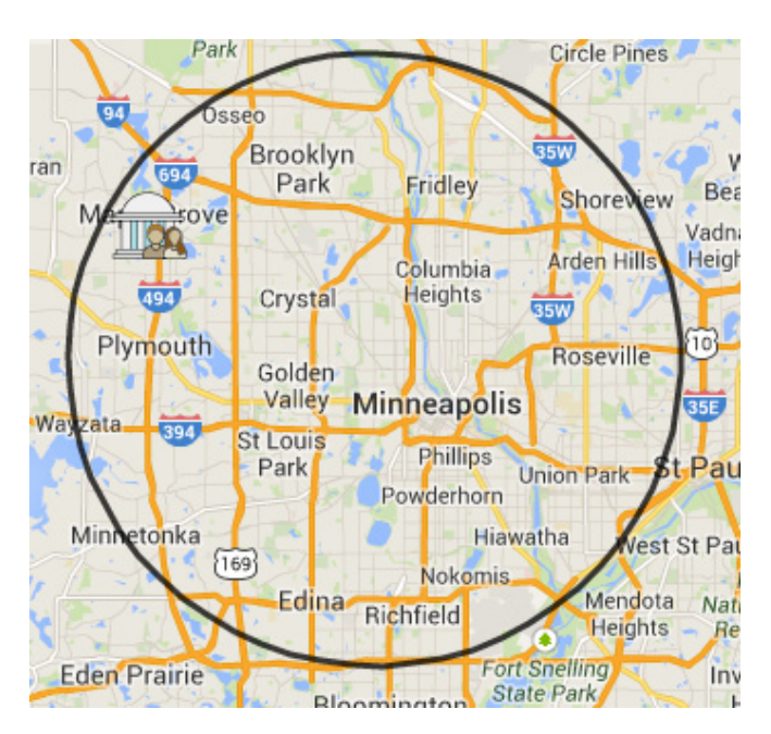
FIGURE 9-3: 20 MINUTE DRIVE TIME – INTERSECTION OF PENN AND BROADWAY. GREATER MSP ZOOMPROSPECTOR

FIGURE 9-2: 10 MILE RADIUS – INTERSECTION OF PENN AND BROADWAY. GREATER MSP ZOOMPROSPECTOR