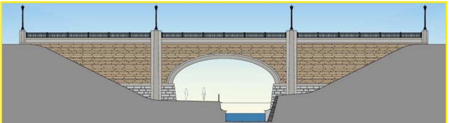
Lyndale Bridge – West Elevation Looking East Alternative 1 (of 5) – June 15, 2010

The reconstruction project includes the bridge itself, general traffic lanes, improved intersection controls, sidewalks, ornamental railings, and lighting. Additionally included are pedestrian and bicycle access paths between the bridge and Minnehaha Parkway, Minnehaha Creek embankment stabilization, and re-establishment of vegetation that will be impacted during construction.