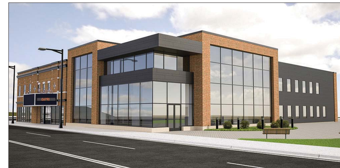
Proposed Capri Theater expansion