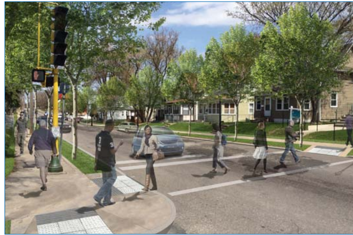
Rendering of the approved redesign for a typical section of the avenue

Improve safety for pedestrians and make Penn more livable for everyone with a new road layout, streetscaping and BRT.