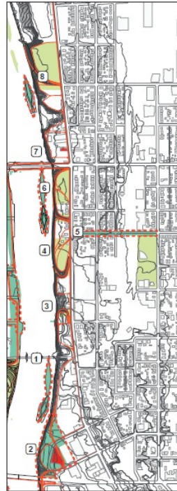
0–5 Year Implementation Plan