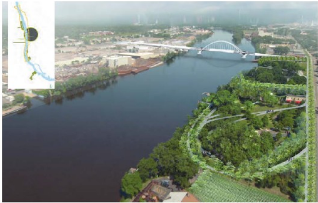
Aerial view of East Side park – biofiltration path and ravine at Gluek Park

For Northeast Minneapolis, RiverFIRST follows principles of carving produced by the constant flow of water against the river's limestone bluffs. Ravine landscapes remediate storm water and form stepped eco-stairs for flows of water, people, and wildlife, and serve as high points to overlook the Mississippi and downtown Minneapolis. These new open spaces, contemplated primarily as resources for the environment and local residents, will intermingle with existing smaller privately-owned parcels along the riverfront that contain a variety of uses. Some of the ravines are envisioned to provide public access to the river, with the potential for small boat launches and docks.