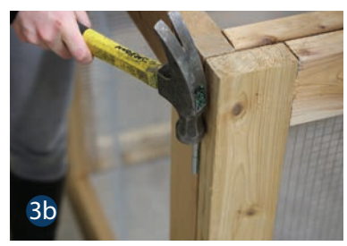
3b) Use a hammer to secure the pins if needed.

If you have any questions about assembling your bin, contact Hennepin County Environment and Energy at 612-348-3777.