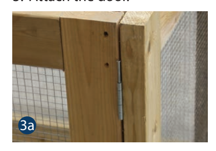
3a) Line up the hinges on the door with the hinges on the side wall. Insert the pins provided into the hinges.